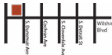
Northwest corner of Wilshire Blvd & Dunsuir Ave