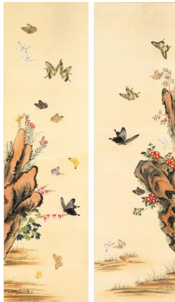
Park Jinmyung/“ Flowers and Butterflies“