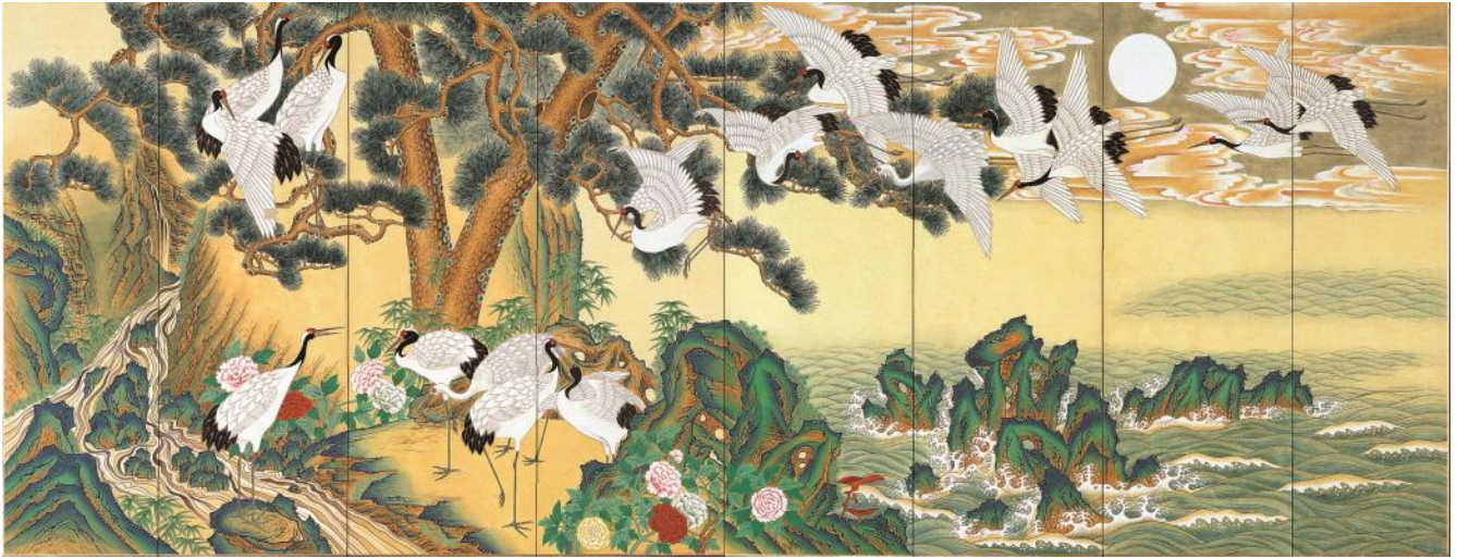
Song Kyu Tae/“Crane and Pine Tree“ 120×392 inches Eight-panel screen

“The value of Minhwa is reminded once again in LA”