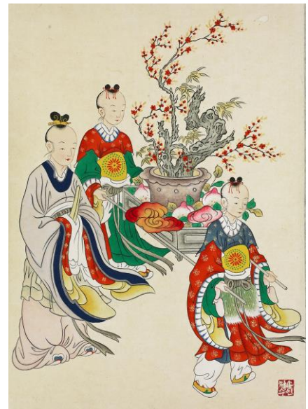
Song Chang Soo/“ Child“