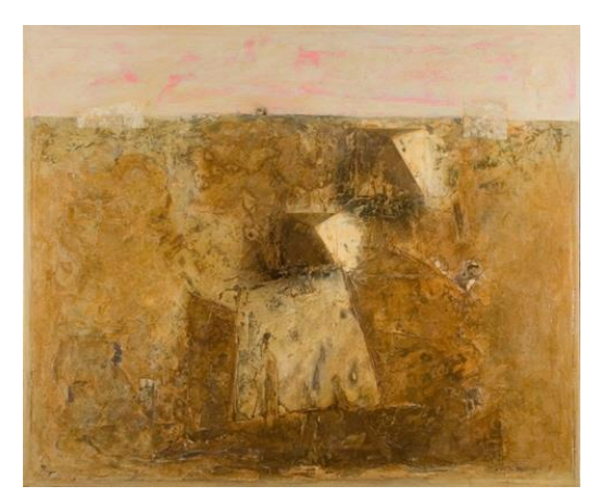
Whi Boo Kim Geo Series 2005 50x60 inches