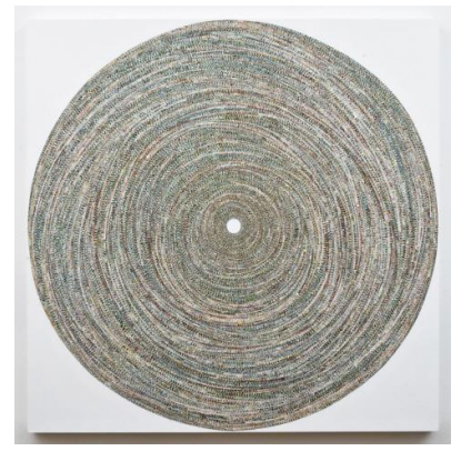
Yong Sin Circle No. 515, 48x48 inches