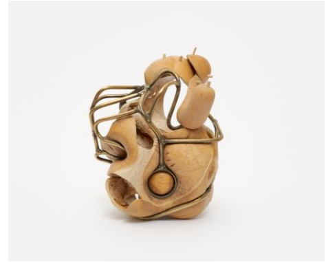
Typecast 000 Cultivated Gourd, Brass Plated Steel, pegs 8 X 9 X 11 inches, 2019

Korea Arts Foundation of America (KAFA) & Korean Cultural Center, Los Angeles (KCCLA) proudly present the "The 16th Korea Arts Foundation of America Award Recipient Exhibition: All of the Above," which will take place from November 8 th to November 22 nd , 2019 at the Korean Cultural Center Art Gallery, located at 5505 Wilshire Blvd. Los Angeles, CA 90036.