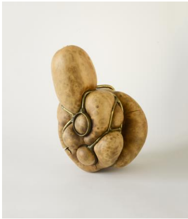
EEEERRRRGGHHHH Cultivated Gourd, Brass Plated Steel, 11 X 8 X 7 inches, 2015