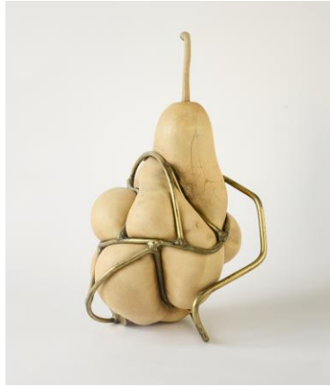
WAAHH Cultivated Gourd, Brass Plated Steel, 14 X 9 X 7½ inches, 2015