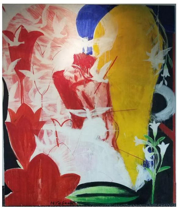
Summer Garden, 48x60 inches, Oil on Canvas

She mentions that "Through painting, I search for or create space that I find reflected in Asian and Western art traditions," she says. "I am looking for depth of space represented on a flat surface. This depth of space goes beyond three dimensions to depict a personal cosmology. The content of my work is derived from political events, the history of painting, and personal experience."