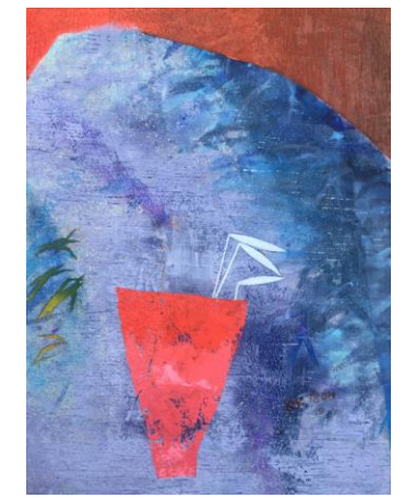
Eunsil Jeong, Cactus Series