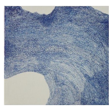
Ecdysis Continuum 08 /10(H)x10(w) inches