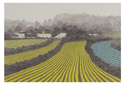
Fields / 110(H)x158(W)cm