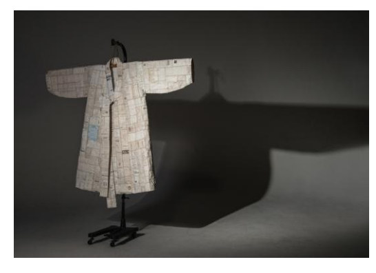
The United Stitches / 63(H)x 55(W) inches